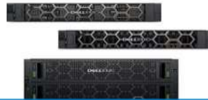
DELL EMC POWERVAULT ME4 SERIES