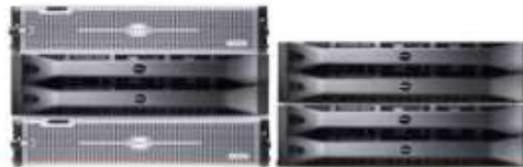
DELL EMC POWERVAULT MD SERIES