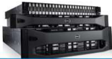
DELL EMC EQUALLOGIC PS SERIES